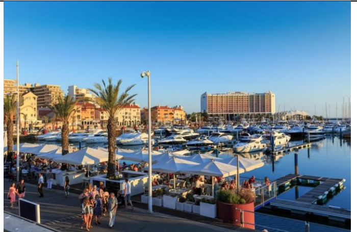
Formosa, Culatra (40nm)