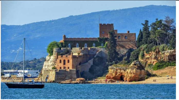
Ponta João de Araes (3nm)